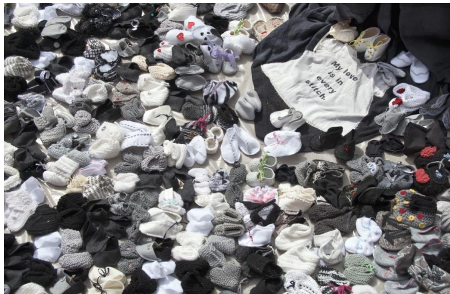
The Mourning Project, installation view, detail.